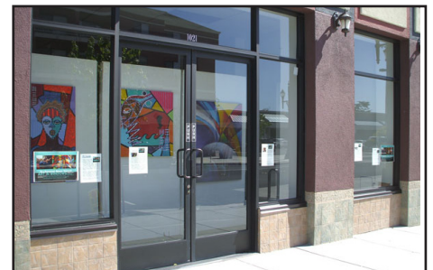
Local artists display their artwork in a vacant storefront on Macdonald Avenue as part of the Art In Windows program.