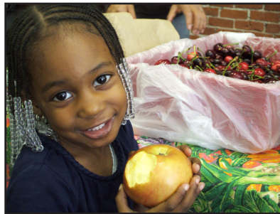
Our Healthy Village Farm Stand events provided fresh produce and nutrition information to hundreds of residents in 2011.

Richmond Main Street is growing by leaps and bounds. We have a bright future ahead and expect to continue to be the catalyst for positive change downtown. We invite everyone to join our efforts building on this momentum as we work to implement a PBID that will provide a public/private partnership to revitalize downtown. ■