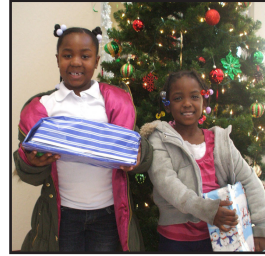
Passing out gifts and creating happy memories for Iron Triangle youth at the annual Holiday Festival.