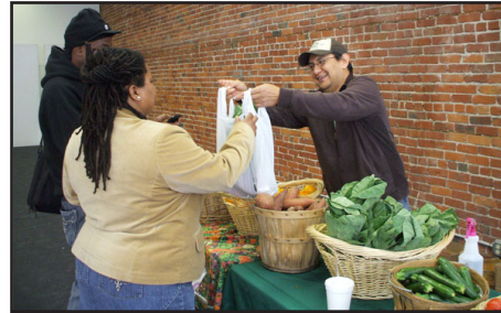
Downtown residents pick up a bag of free produce courtesy of EcoVillage and HEAL at Healthy Village Farm Stand.

In partnership with the West County HEAL Collaborative, Richmond Main Street sponsored its second year of the Healthy Village Farm Stand, an event all about health and wellness in Downtown Richmond. Hundreds of residents and workers came downtown on the 1st Friday of the month, June-August, to enjoy free, farm-fresh produce courtesy of EcoVillage Farm, flower salad samples and healing herb seedlings from CURME, information about services and resources offered through RecycleMore, Weigh of Life, First 5, GRIP, and others, as well as pony rides and educational arts and crafts activities for kids.