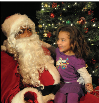
A little girl meets Santa at the annual Downtown Holiday Festival.

The air was teeming with excitement as dozens of families filed out of the East Bay Center for the Performing Arts on Wednesday, December 12 th into the chilly evening air. Following the Center’s Son de la Tierra group performing a La Rama procession, the crowd gathered on 11 th Street to enjoy traditional holiday music, dance, carols, and remarks by City officials and community representatives, who led a countdown to the grand finale of the annual Downtown Holiday Festival: the magical, simultaneous illumination of dozens of snowflakes and wreath shaped street lights along Macdonald Avenue.