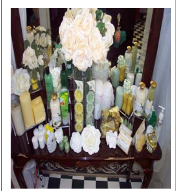
Just a sample of the charming products to be discovered at Satin

Satin & Lace Boutique features two exclusive lines, Terra Nova and Cloud Nine, of bath essentials, perfumes, and scented candles. "These can only be found at Satin & Lace Boutique, no other department store sells them. This is Dwatha and Cynthia's line."